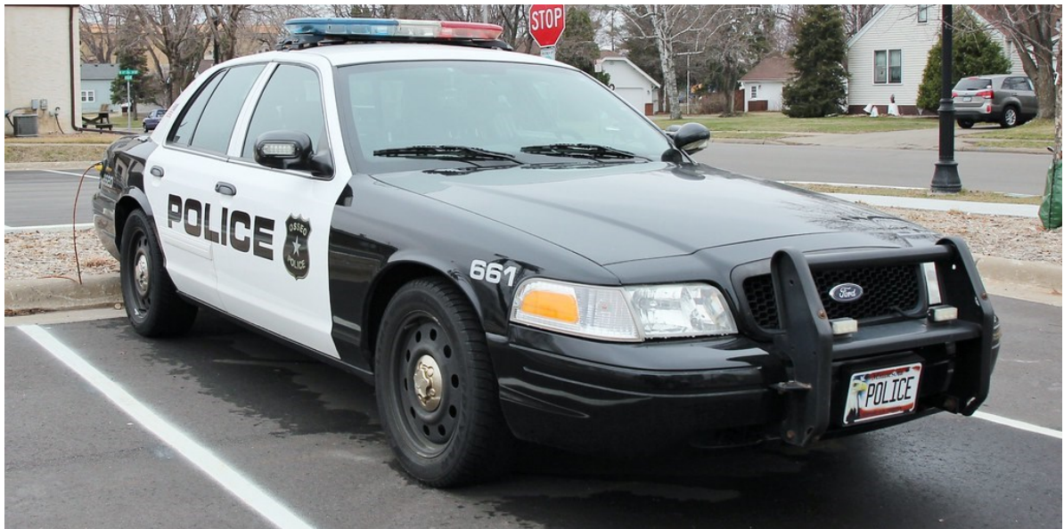
Osseo Squad 661 2011 Ford Crown Victoria

THE MISSION OF THE OSSEO POLICE DEPARTMENT IS TO ENHANCE THE QUALITY OF LIFE OF ITS CITIZENS AND STRENGTHEN THE BOND BETWEEN THE POLICE AND COMMUNITY THROUGH A TRADITIONS OF LEADERSHIP, COMMITMENT AND SERVICE