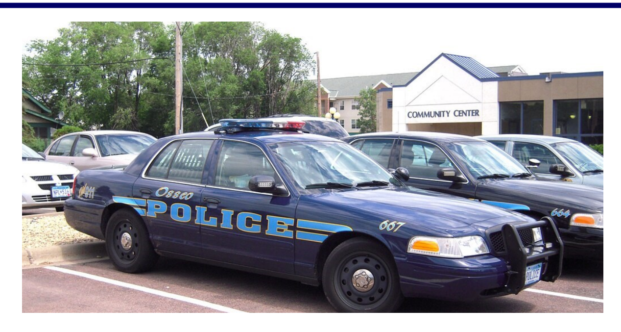
Osseo Squad 667 2007 Ford Crown Victoria