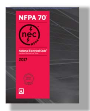
Based on the 2017 National Electrical Code® (NEC®).

An owner (i.e. homeowner) who files a Request for Electrical Inspection form with the Department of Labor & Industry or other electrical inspection authority is signing an affidavit that they own and occupy the residence and they will personally perform all of the electrical work, including the planning and laying out.